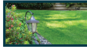
TURF & AGRICULTURE