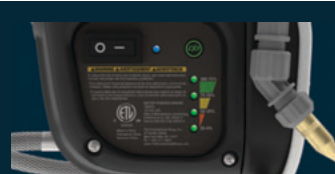
LED BATTERY LIFE INDICATOR