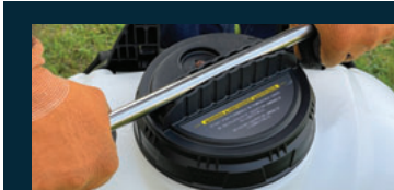
CAP WAND GROOVE FOR TIGHTENING & LOOSENING