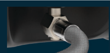
NICKEL-PLATED BRASS SWIVEL HOSE CONNECTION