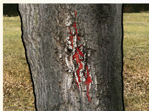
Sudden Oak Death (S.O.D.)