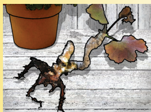
Root Rot Diseases