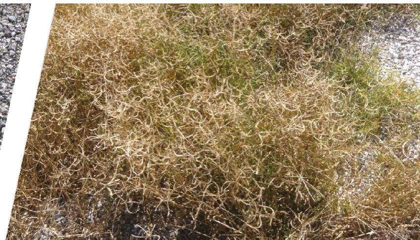
Glyphosate 0.73 fl. oz./1,000 sq. ft. Bayer, Clayton, NC, 2012, HE12NARDS3

ALWAYS READ AND FOLLOW LABEL INSTRUCTIONS. Not all products are registered in all states. Bayer®, the Bayer Cross, Roundup® and Roundup QuikPro® are registered trademarks of Bayer Group. All other trademarks are the property of their respective owners. ©2023 Bayer Group. All rights reserved.