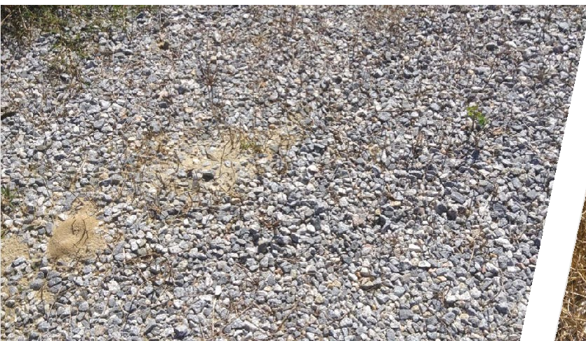
Roundup QuikPro® SC Total Herbicide 16 fl. oz./1,000 sq. ft. Bayer, Clayton, NC, 2012, HE12NARDS3