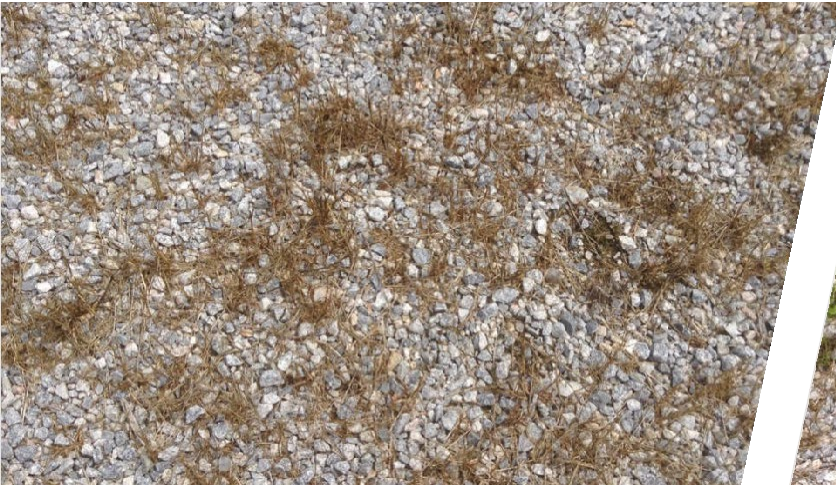
Roundup QuikPro® SC Total Herbicide 16 fl. oz./1,000 sq. ft. Bayer, Clayton, NC, 2012, HE12NARDS3