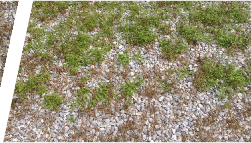
Glyphosate 0.73 fl. oz./1,000 sq. ft. Bayer, Clayton, NC, 2012, HE12NARDS3