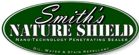
Smith's Shield Series | 1) Water Shield – Brick patio | 2) Enhancer Shield – Flagstone patio | 3) Stain Shield – Oil, Water & Glass Cleaner

Hybrid penetrating sealer that can be applied as a clear, non-darkening sealer to concrete & other porous substrates.