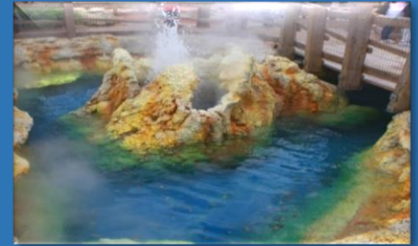
1) Pavers – Poly-SB Gloss | 2) Rockscape – Color Wall with Poly-SEALs | 3) Faux Geyser – Color Floor & Color Accents