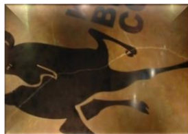
Smith's Liquid Dye & Smith's Surface Guard

Premium Lithium / Potassium Silicate Blend DENSIFIER LP For Polished & Burnished Concrete