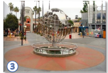
Smith's Color Floor: 1) Commercial office / food court | 2) Retail flooring | 3) Artistic compass