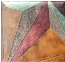
Smith's Color Accents

BASE BOOST with FLOUROPOLYMER TECHNOLOGY Lithium/Potassium Silicate-based blend Concrete Densifier/Adhesion Promoter