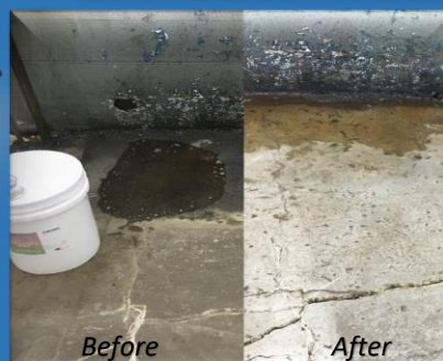
Smith's Oil Clean