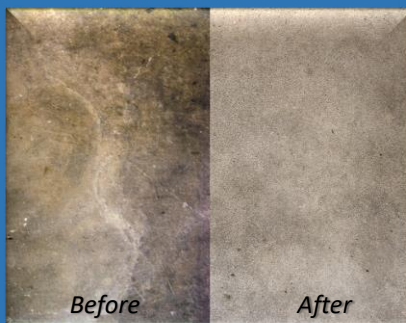
Smith's Green Clean Pro