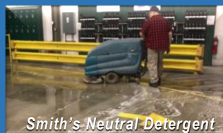
Smith's Neutral Detergent